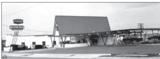
Another popular gathering spot was the What-A-Burger on South Collins Street

officers and board members will have another planning meeting in the near future, at a date and time to be selected. The meeting will be open to the public.